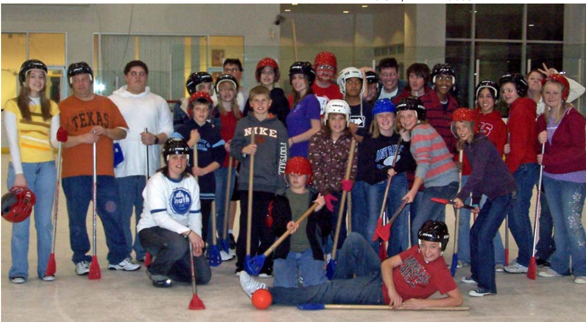
Concordia's World Famous Broomball Team